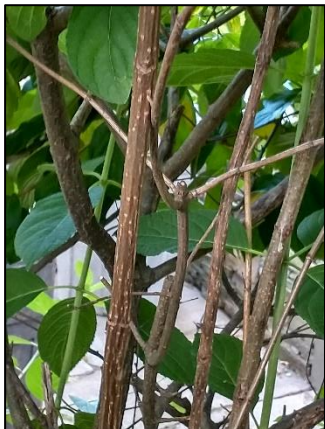
Yes, remove the dead wood!

Should I prune the dead wood within the center of my shrub, which will result in a gaping hole? Or do I leave the dead wood?