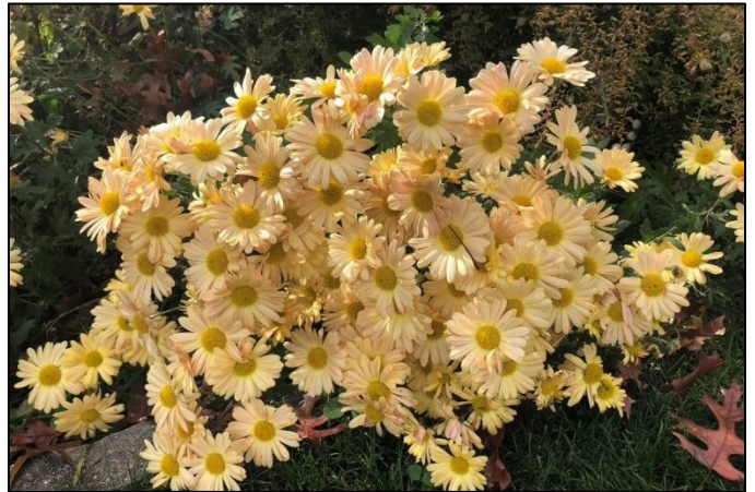
Chrysanthemum ‘Rustic Glow’

Without consistent watering, or with a sudden hot day, chrysanthemum morifolium can dry up quickly, and we are left with sad brown clumps where we had hoped for a few weeks of glowing reds and yellows. Far be it from me to discourage planting them, but they can bring some disappointment, making the word “hardy” seem deceiving. On the chance that yours do well, wait to cut them back until early spring, which will give you a much better chance of a return appearance the following fall.